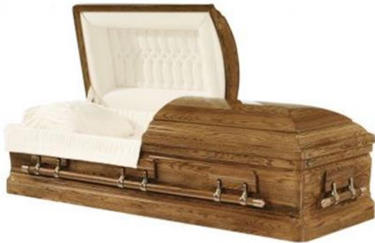
The Parliament by Victoriaville #WR210-20848 Red Oak 1" and 2" stock timber Ivory velvet interior

All caskets listed are "Adult" caskets. Youth and Plus Size caskets are available and further information and pricing is available upon consumer request.