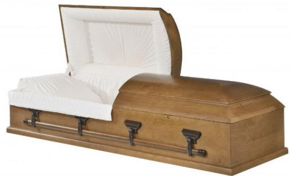
The Puma by Victoriaville #WR252-00180 Poplar and veneer 1" stock timber and 5/8" material Beige crepe interior