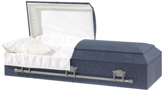
The Winston by Victoriaville #DR220-00044 MDF 5/8" material Blue figured cloth exterior White silk interior

All caskets listed are "Adult" caskets. Youth and Plus Size caskets are available and further information and pricing is available upon consumer request.