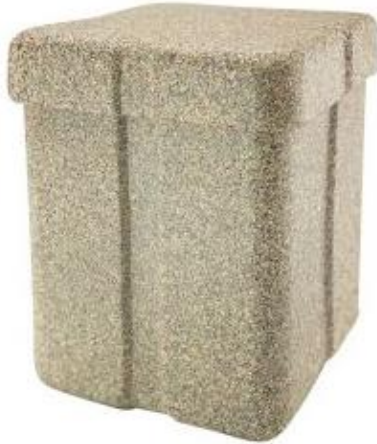
Sandstone by Victoriaville #G0000-20023 Polyethylene with a sandstone finish