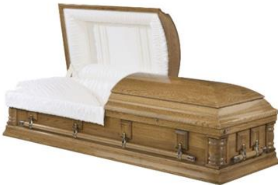
The Simcoe by Victoriaville #WC212-00002 Red Oak 1" stock timber Tan crepe interior **Interchangeable corner option available**