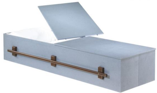
The Hampton by Victoriaville #DR520-00033 MDF 5/8" material Gray cloth exterior White silk interior