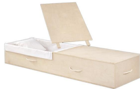
The Glencove by Victoriaville #CR879-00033 Solid select wood Natural maple woodgrain White crepe interior