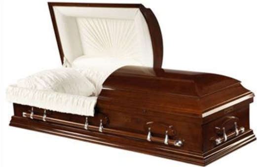
The Dominion by Victoriaville #WR220-00379 Maple 1" stock timber Tan crepe interior