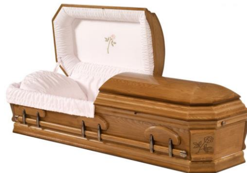
The Fairholme by Victoriaville #WR210-00195 Red Oak 1" stock timber Dusty pink crepe interior